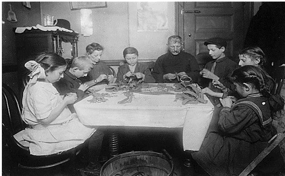
Garters by Lewis Hine