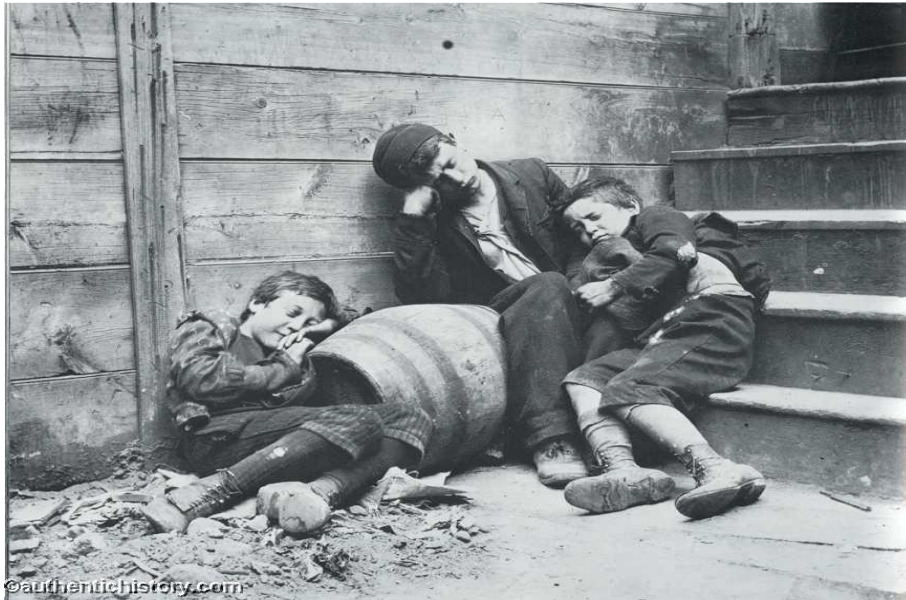
Street Arabs in night quarters (from How the Other Half Lives by Jacob Riis.)